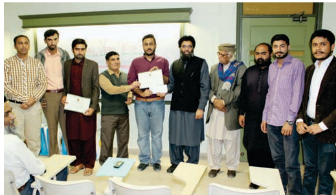
Engineering, Science & Technology gave vote of thanks and congratulated the students and faculty members.