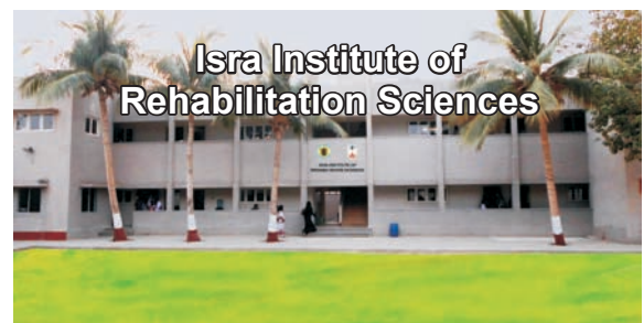
Isra Institute of Rehabilitation Sciences