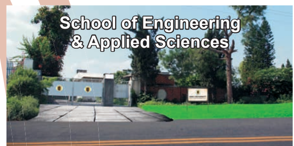
School of Engineering & Applied Sciences